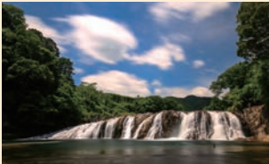
Tsuta no Fuchi

•Toei-cho Kanko Machizukuri Association TEL. 0536-76-1780