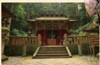
Horaisan Toshogu Shrine