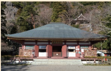
Horaiji Temple Main Hall