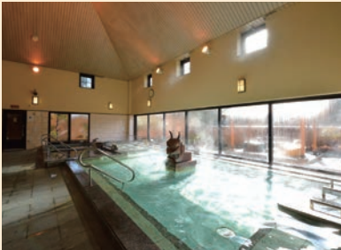
Hana Festival Hot Springs of Toei Onsen