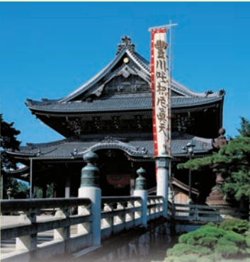
Toyokawa Inari Shrine (Myogonji Temple)

•Toyokawa Tourist Association TEL. 0533-89-2206