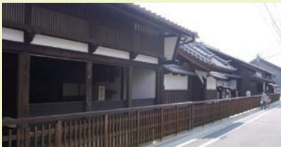
Futagawa Shuku Honjin Museum