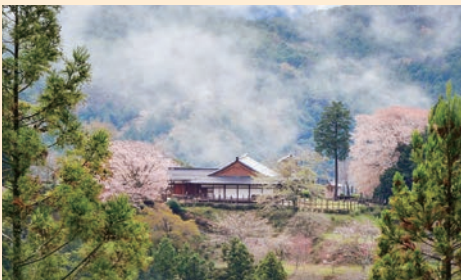
Histrical Village Damine Castle